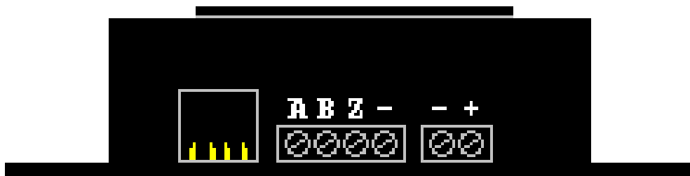
TTL Signal form